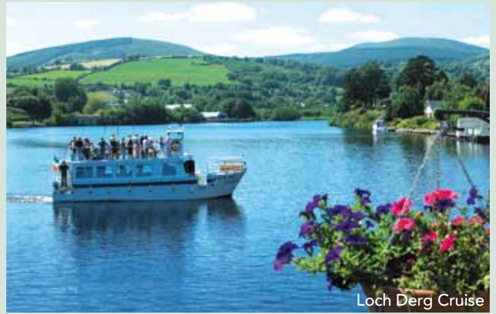
Loch Derg Cruise